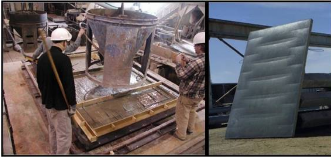
Fig. 1. Full-scale formwork and completed concrete panel.

This novel way of forming concrete has been experimented with by individuals and institutions internationally in recent years but little engineering analysis and system verification or validation through experimentation has been conducted. Due to the complex shapes that can be achieved with fabric forms their analysis is beyond the computational formulae currently used to calculate simple prismatically shaped member capacities. Prior to the P.I.'s initial research into this unique method of forming concrete no design procedures or methods to predict the deflected shape of a fabric cast concrete member had been developed. And, from an engineering point of view the challenge was to find a method to analyze the complex structural shape a fabric cast concrete wall panel could ultimately take. If a flexible formwork system is to be of practical use a method to analyze the forming system and the members produced by it must be put into place.