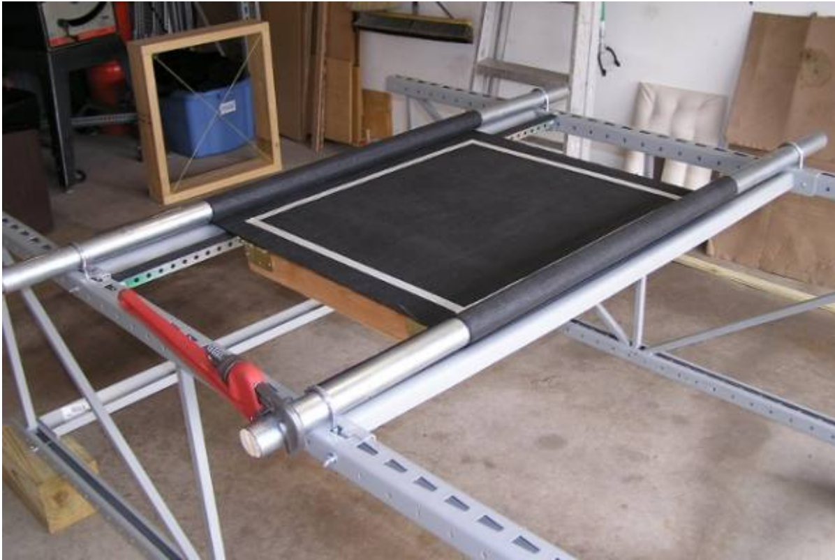
Figure 3: Test Frame with Fabric.