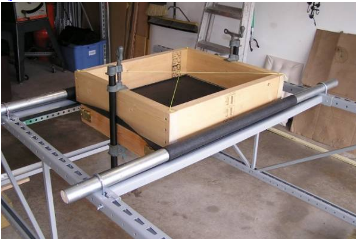
Figure 4: Test Frame with Curb.